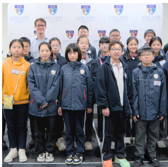
Zhangjiagang, China - 2024

Adelaide International School offers study tours to international students who are interested in improving their English language skills and experiencing local culture. English language courses are personalised for each group based on their pre-existing English language levels. Local excursions and activities are integrated into the program, including visits to local private schools. Study Tours allow international students the opportunity to observe the Australian education system, experience local culture, and develop their English language skills through Adelaide International School's coordinated activities. They are a fantastic experience for any student who is contemplating studying in Australia, or who wants to immerse themselves in Australian culture.