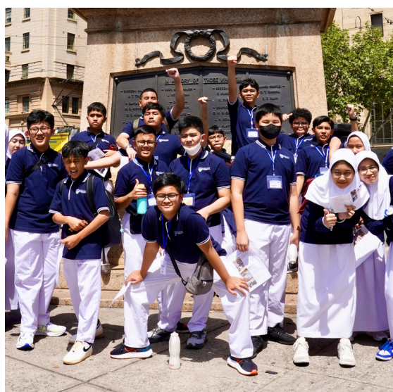
SMP Al Azhar 1, Indonesia - 2023