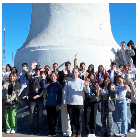
BOSA, Indonesia - 2023