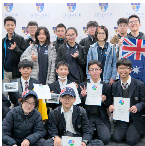
Kogakuin, Japan - 2024